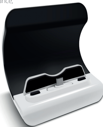
CDUK USB docking station (sold separately)

Powered by a 750mAh Lithium-Ion rechargeable battery, the SQ610RF guarantees long-lasting performance, with a single charge providing up to two years of reliable use. This extended battery life minimizes maintenance and ensures continuous operation, making the SALUS SQ610RF an efficient and user-friendly choice for modern home climate control.